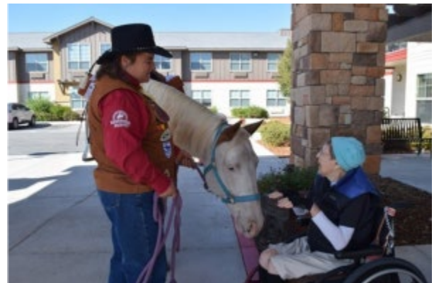
“T” visiting with one of the veterans – checking to see if she had more carrots!