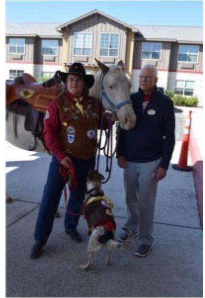
"T" bowing for the Veterans