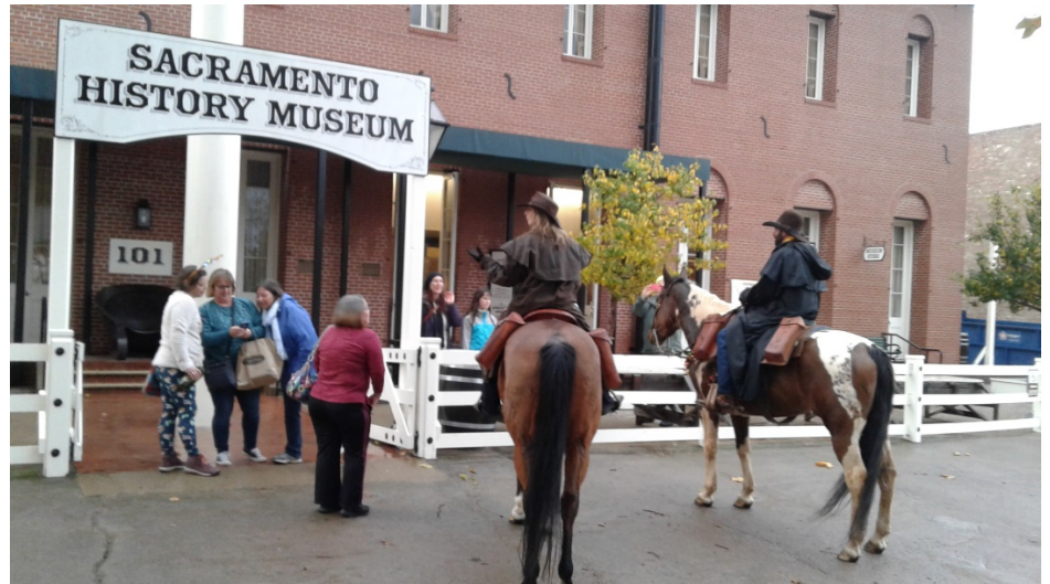
Riders talking about the Pony Express.