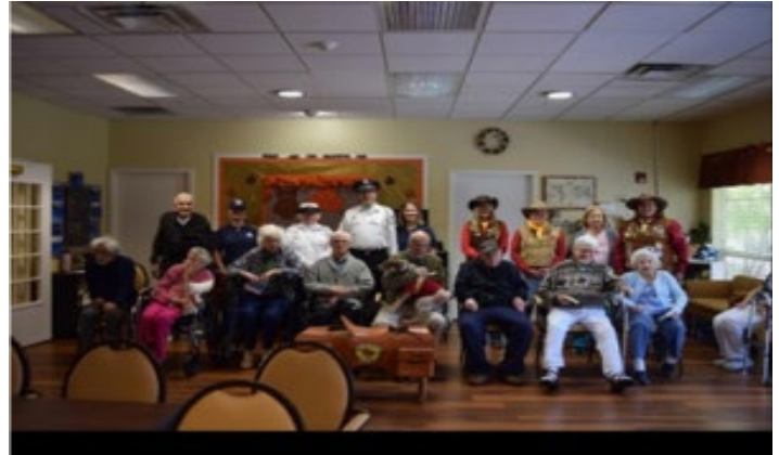
Giving out the letters