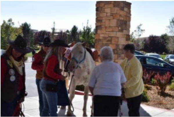
Handing out the letters