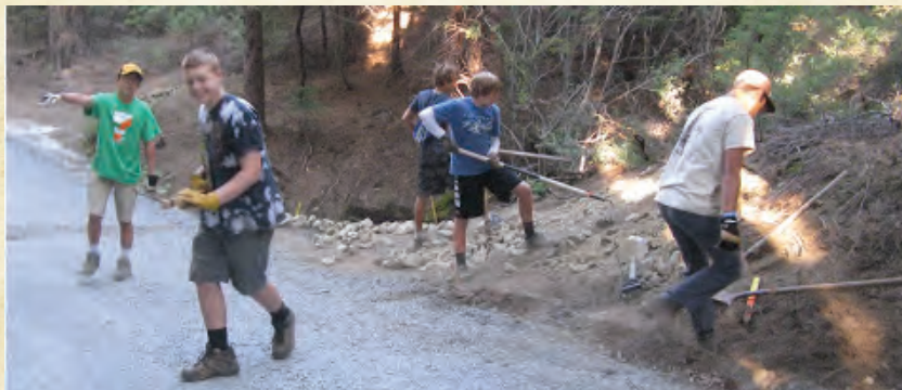
BSA Troop #186 riprap for the creek

2018 is a major milestone for the national trail system.....it marks the 50th anniversaries of the National Wild & Scenic Rivers Act and the National Trails System Act. The Pony Express (XP) Trail is an historic trail protected by the National Park Service. The XP California Division partnered with the Back Country Horsemen of California - Mother Lode Unit and the US Forest Service to improve public access and trail maintenance on the Pony Express National Historic Trail. Multiple projects were planned in 2017, then initiated in 2018.