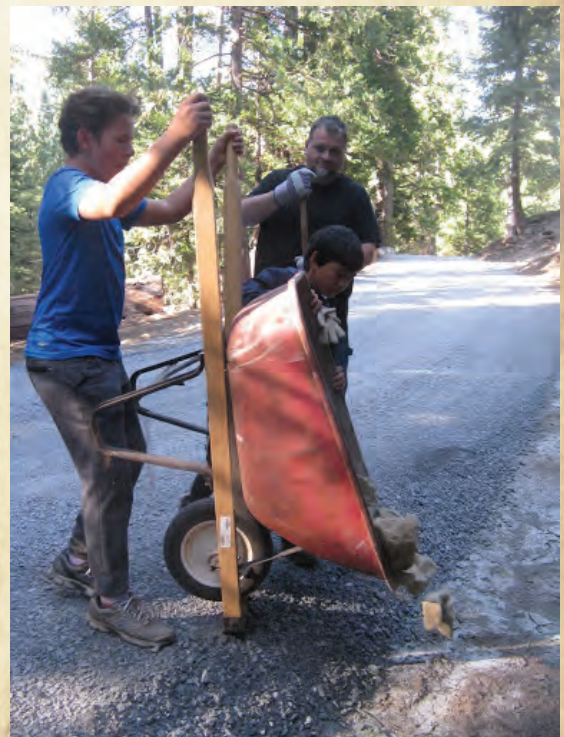
Troop #186 Elk Grove

The second Troop #186 came from Elk Grove, CA. They did trailhead improvements by installing riprap (cobblestones) at various locations subject to erosion, especially three spots that drain into the seasonal creek. This troop also agreed to adopt 12 miles of the trail for spring pruning and fall culvert cleaning. An Eagle Scout candidate is proposing a mapping project to be included in the USFS handouts for trail users. Another candidate is considering installing a gravity fed water feature for the horses. No doubt about it....improving the vehicle access to the trailhead also improves the public usage and volunteer maintenance of the XP Trail.