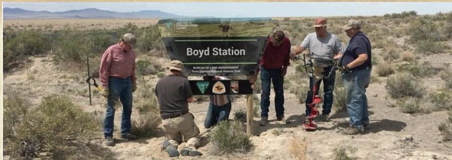
Utah Division installing signage