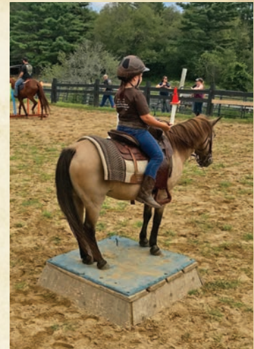
Scout & Tonto

I hung the mailbag over my shoulder and jumped onto Tonto. We rode to the first outpost. I handed the mailbag to the next rider. They raced off with the mail. Now it was time to take care of my horse. I fed, watered and brushed Tonto. We were all excited when the mail was finally delivered.